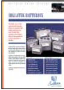
Solar batteries leaflet