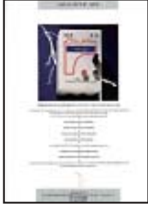
AVS three phase leaflet