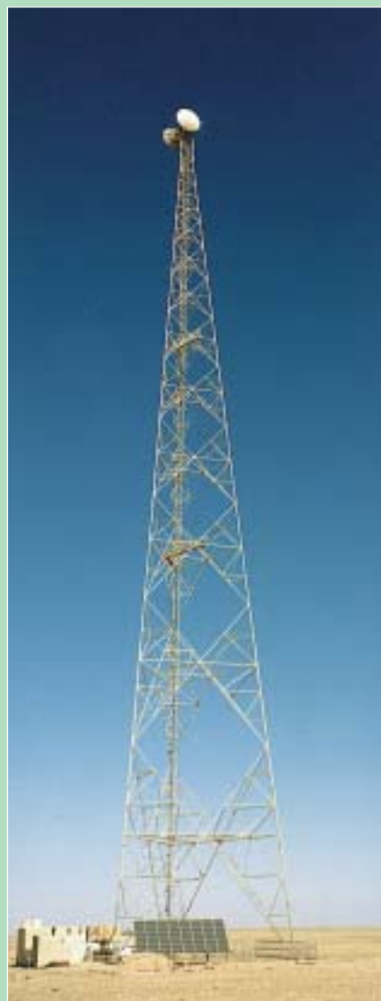
£1.6 million Solar Telecoms