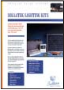
Solar lighting kits leaflet