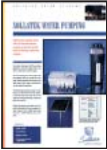
Solar water pumping leaflet