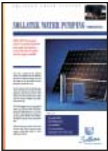
Solar water pumping (pro) leaflet