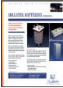
Solar batteries (pro) leaflet