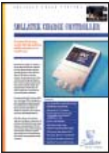
Solar SPCC16E leaflet