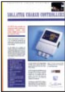
Solar SPCC10E leaflet