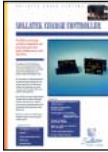
Solar SPCC05 leaflet