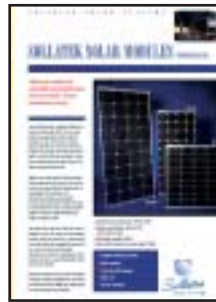
Solar modules leaflet