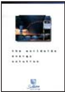
Solar General brochure