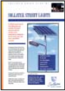
Solar street lights leaflet