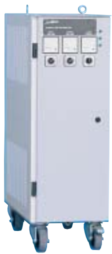
AVR3x50 including meter options

One major project was the protection of a complete new GSM mobile telephone system from the main switch to all base station transmitters.