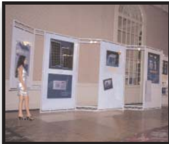
The exhibition display stand at the launch