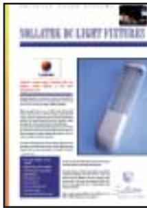
Solar light fixtures leaflet