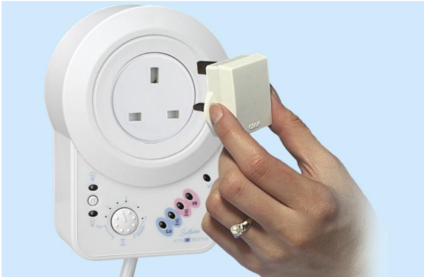
The Sollatek AVS provides complete protection