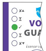
❸ Green LED = full output