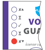
❶ Red LED = no output