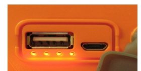
USB for phone charging Micro USB for Lantern charging LEDs showing battery level