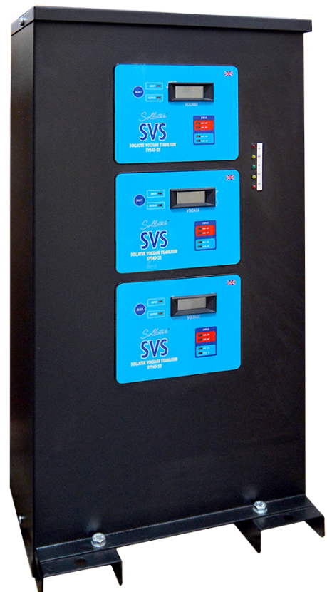
THREE PHASE SVS