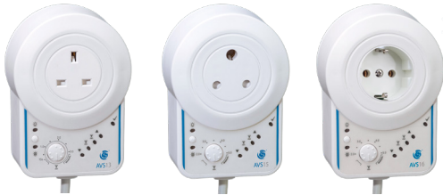
AVS13 & AVS13RL

The Sollatek Automatic Voltage Switcher (AVS) Range